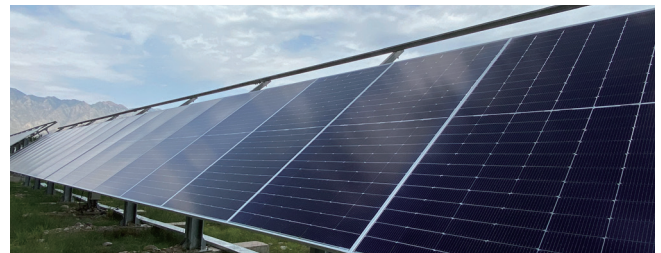
Figure 3. The project picture

Since irradiation, installation tilt, the ground albedo or the module height above the ground, the temperature, will impact on energy gain. The higher the albedo or the height above the ground, the more irradiation the rear side could receive from the surrounding environment, and thus the more power generation. If in the same installation environment and design, the N-TOPCon bifacial modules show dominant advantage in energy generation with lower operating temperature coefficient, higher bifaciality factor and superior low light performance in the morning, dusk and cloudy days.