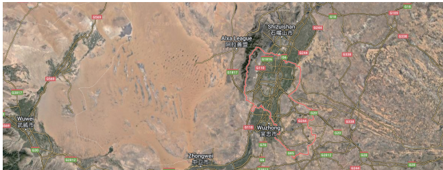
Figure 1.The location information of Yinchuan

An experimental study on the energy yield performance of TOPCon bifacial PV modules compared to PERC bifacial PV modules was conducted in Yinchuan (38 ° 35 ' N, 106 ° 1 ' E) , Ningxia province, the northwest of China. The experimental results have proven that the energy yield gain of TOPCon bifacial modules is up to 3.82% higher than that of the PERC modules.